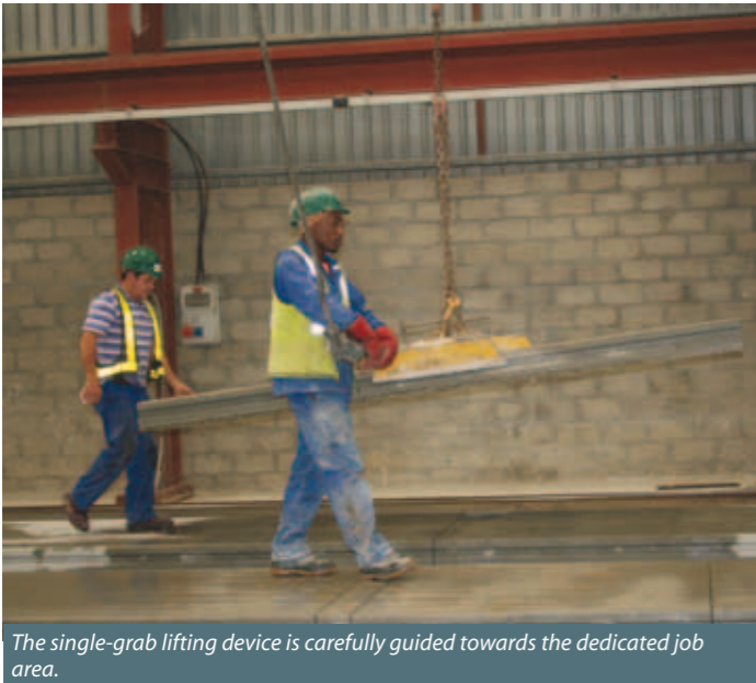
The single-grab lifting device is carefully guided towards the dedicated job area.

designed to carry the dead and live loads required. Precast beams, precast walls, poured concrete beams and walls, masonry walls, insulated concrete forming system walls, wood and steel stud walls and structural steel beams, are all suitable for use with hollowcore as load bearing systems. The slabs are designed as individual, one way, simple span slabs. When installed and grouted together at the keyways, the individual slabs become a system similar to that of a monolithic slab. A major benefit of the slabs acting together is the ability to transfer forces from one slab to another.