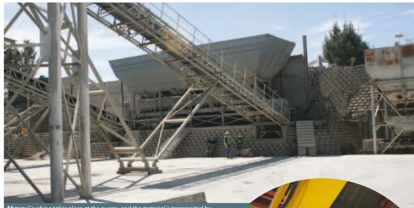
Above: Crushing takes place at the quarry, and the material is transported by loaders to the aggregate bins at the hollowcore facility.

Ordered from specialist manufacturer of high-quality modular formwork systems and precast moulds, Cometal nv, the adjustable staircase moulds are used for casting straight run prefabricated stairs. The staircase mould can be variably adjusted by a mono command so that different types of prefabricated staircases can be cast, such as the amount of treads, height of riser, thickness of the stairs, etc. The mould guarantees an exceptionally