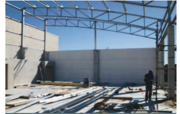
The company also recently completed a major walling system for Hirsch's in Montague Gardens. Well known in Gauteng, this is the first Hirsch store in the Western Cape. As the showroom was due to be opened in the Easter weekend, the walling system was a quick and viable option.

Portland Hollowcore is currently supplying product for MNK Projects for the development of several Curro schools, in Langebaan, Durbanville, Hermanus and Mossel Bay. "The school close to Canal Walk in Cape Town is more of a campus at about 8 000 m 2 , so we are very happy to be involved," Heyns confirms. Affordable housing is also keeping the company