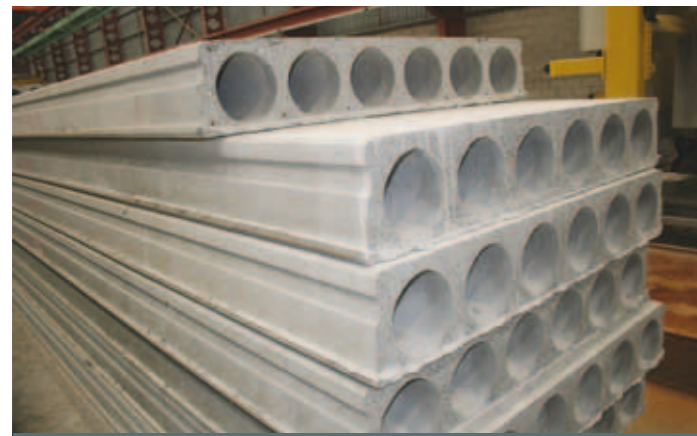
Hollowcore is cast with continuous voids to reduce weight and cost, and as a side benefit, for use to conceal electrical wiring or mechanical ducts.