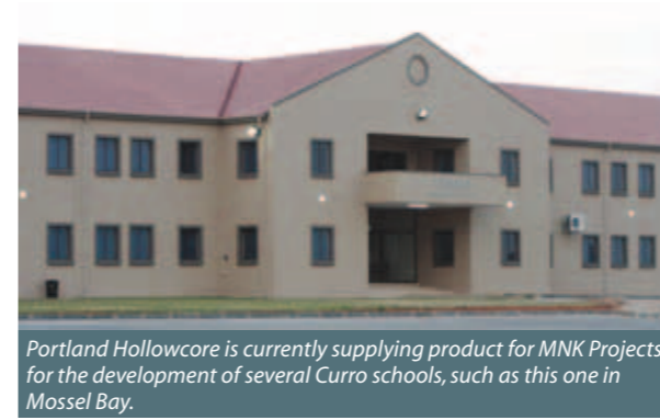
Portland Hollowcore is currently supplying product for MNK Projects for the development of several Curro schools, such as this one in Mossel Bay.

with a maximum span of 6,5 m; and 200 mm with a maximum span of 8,5 m. Other benefits include: