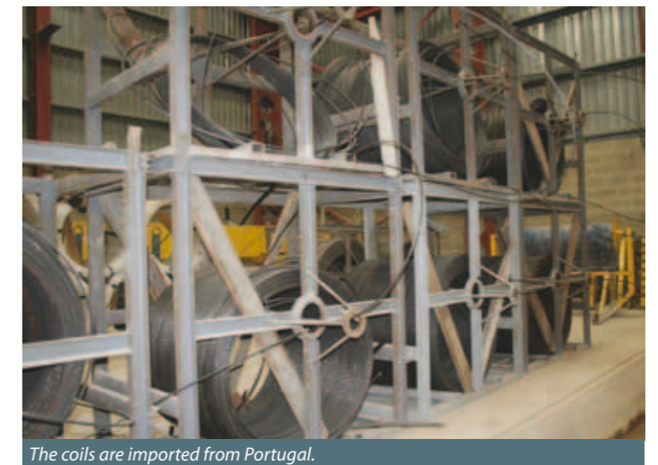
The coils are imported from Portugal.

Walking from the dead side of the factory to the live side, MQ was shown the massive overhead cranes which lift the extruder onto cables some 35 mm above the bed. The coils are imported from Portugal, and the cables are hooked onto the BedMaster, saving considerable manpower. "After the BedMaster expends the mould-release oil, you hook the cables onto the machine and it travels down, and decoils. We use