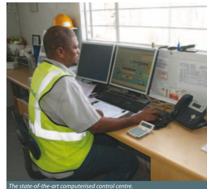
The state-of-the-art computerised control centre.